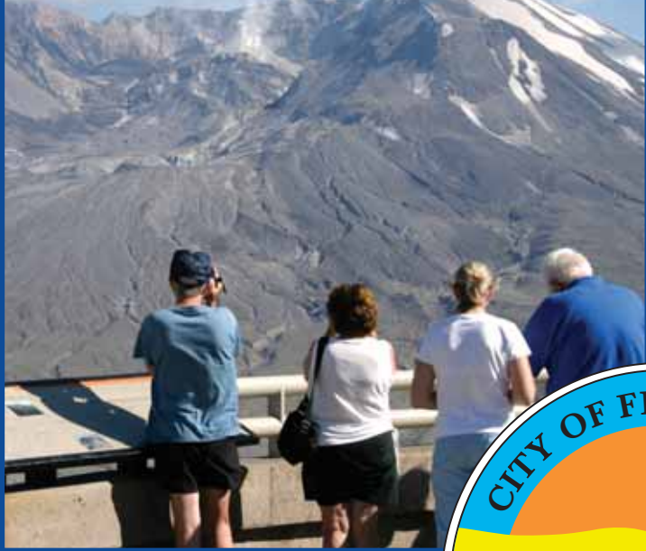
Mount St. Helens National Volcanic Monument